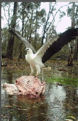
White-bellied Sea Eagle on Carcass See page 2

To comment please feel free to contact any committee member or attend at the next meeting.