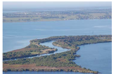
Aerial of Silt jetties