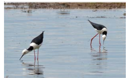
Black-winged Stilts at Marlay Point.

If you would like to volunteer or have data to contribute please contact FOGL committee.