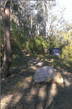
Walking track through Metung bush-land reserve

The Metung Bushland Reserve is a 3.95ha example of Limestone Box Forest that lies within the country of the Tatungolong Clan of the Gunai Kurnai people. It and was originally annexed as a proposed site for a cemetery but was never used as such. By 2007 it was becoming badly degraded, having suffered many years of neglect. FoGL and Friends of Metung collaborated with Parks Victoria to tackle the weeds and secure funding. Monitoring of weeds, path clearing and additional planting is ongoing with the FoM recently removing two trailer loads of